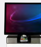
19" (format 5:4)