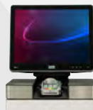
15" (format 4:3)

The look, dimensions, capabilities or other characteristics of this terminal are subject to continual improvement and change.