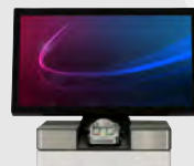
22" (format 16:9, landscape)